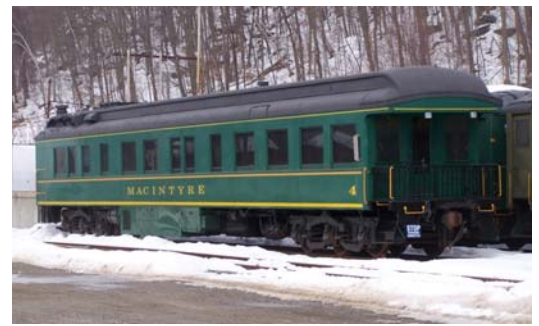
Business Observation Car "MacIntyre"

For more information about these excursions or any other Mass Bay RRE event, visit our web site at www.massbayrre.org , call us at 978-470-2066 , or send email to: trips@massbayrre.org . Mass Bay RRE is a Massachusetts non-profit tax-exempt [501(c)(3)] educational corporation. We have operated train excursions throughout New England since 1934.