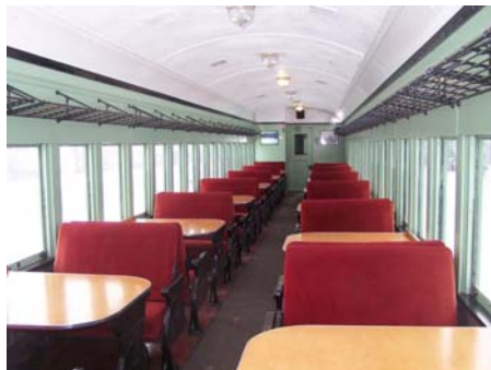
Table Car seating