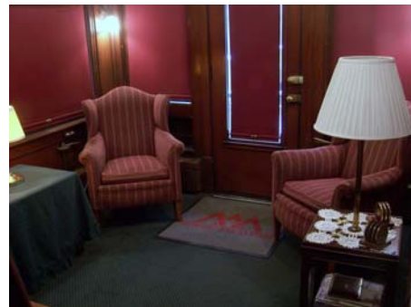
"MacIntyre" rear lounge seating