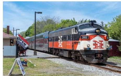
Cape Cod Central's FL9 2011 leads two former Long Island Railroad C1 bilevel coaches.

Boston-area passengers may make a guaranteed connection to our excursion train at Middleboro using MBTA train 1001 from Boston's South Station, Braintree and other stops along the Middleboro line. We'll return to Middleboro in time for connecting passengers to catch MBTA train 1014 back to Boston at 7:04 PM.