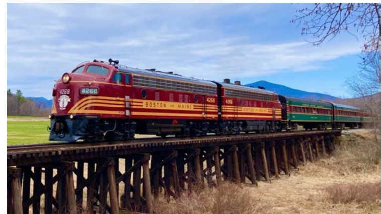
F7A 4268 crosses the Moat Brook trestle during its inaugural run on April 24, 2022 following a lengthy restoration.

All passengers will receive our detailed, full-color trip brochure, including route maps and descriptions of highlights along the route.