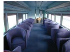
Parlor Car seating

All sales are final and tickets are not refundable. Tickets will be mailed to you in early October along with driving directions to the departure point in Worcester. Special discounted fares and preferred seating are available for Mass Bay RRE members only.